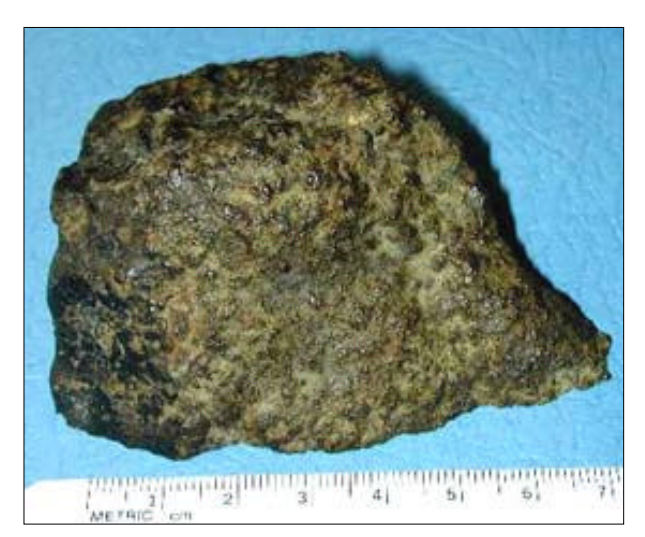
A 186 gram end section of the carbonaceous chondrite called Tafassasset.

This is no longer true. The largest piece, weighing about 30 kilos, has finally been cut, and it is not a Tafassasset! Although it is a meteorite.